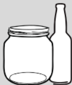
Glass jars and bottles (Unbroken)