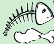
Meat, bones and fish

Residents can line their bins with paper bags or newspaper liners. As well if residents prefer they can purchase at the Lions Bay Municipal office approved certified compostable bags (no others will be accepted)