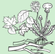
Yard waste and trimmings