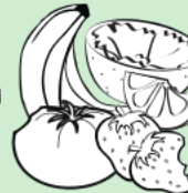
Fruits and vegetables