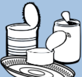
Metal cans and trays