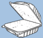
Clear hard plastic take-out containers