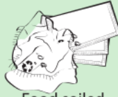
Food soiled paper