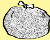
Shredded paper (sealed in clear bag)