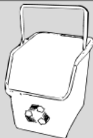
Put out with recycling when full