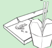
Paper take-out boxes