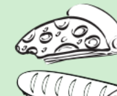
Leftover food scraps