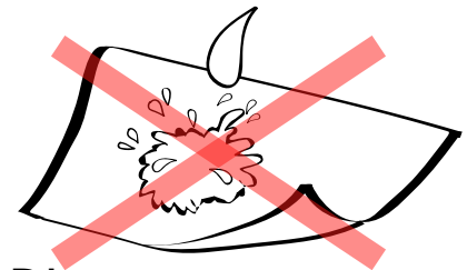
Dirty or wet paper