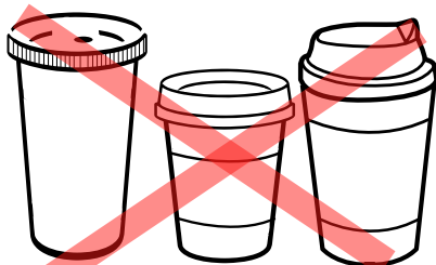
Coffee and pop cups (put in blue bin)

No containers that are plastic, metal, or thickly waxed paper No wet material