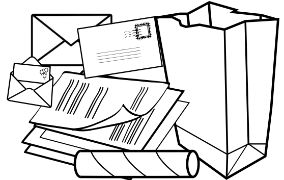
Office and household paper