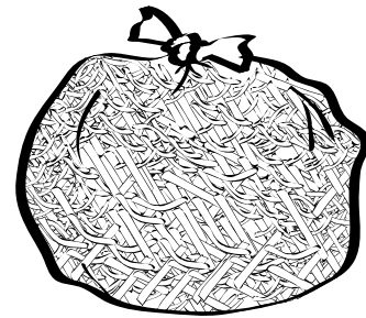
Shredded paper (use clear or paper bags no loose shredding)