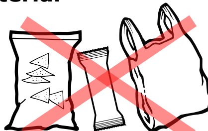
Soft plastics (bring to North Van WCS Depot)