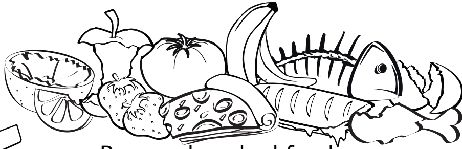
Raw and cooked food scraps

Organic material only All yard waste and trimmings