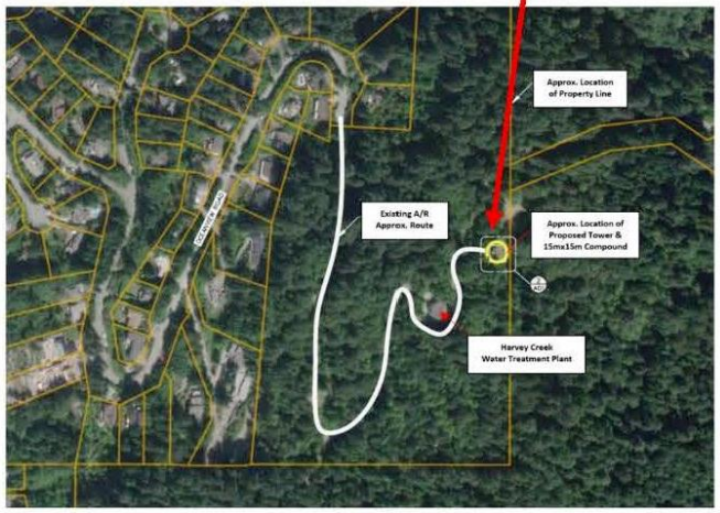
Location of Proposed Telecommunications Tower