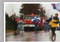
Arrival of the Lions Bay flag during the Spirit of '96 by Phillip Langford at Tidewater Way, January 14, 1996

Please visit Lions Bay Historical Society's web page and Facebook page.