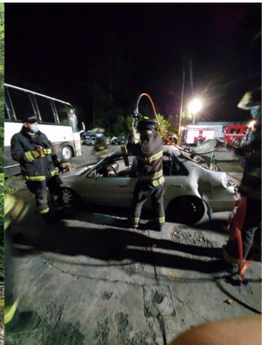
Left: Team on their first practice run