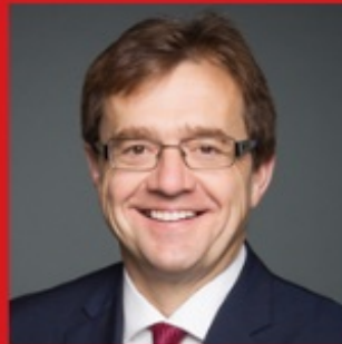
Minister Jonathan Wilkinson