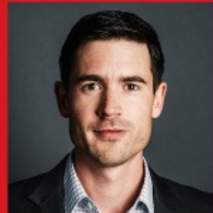
MP Patrick Weiler