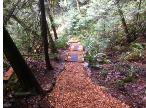
New improvements to Trudi's Trail