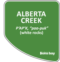
Proposed retro shape for Historical/Naming signage

Black text and border on Pantone 108 yellow with rounded corners.