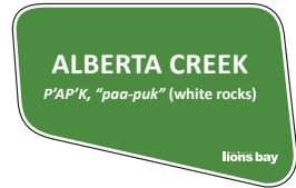
Proposed retro shape for Historical/Naming signage