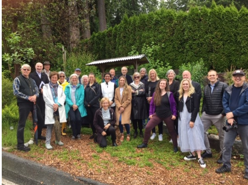
Pictured Above: Mary Comber Miles Indigenous Plant Garden unveiling.