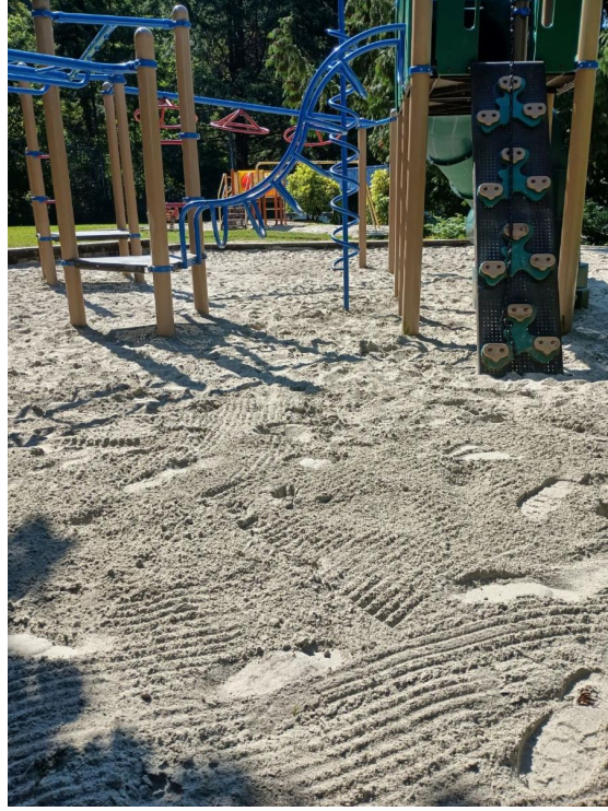
Picture: New sand in the kids play area