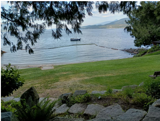
Picture: New Beach and Howe Sound