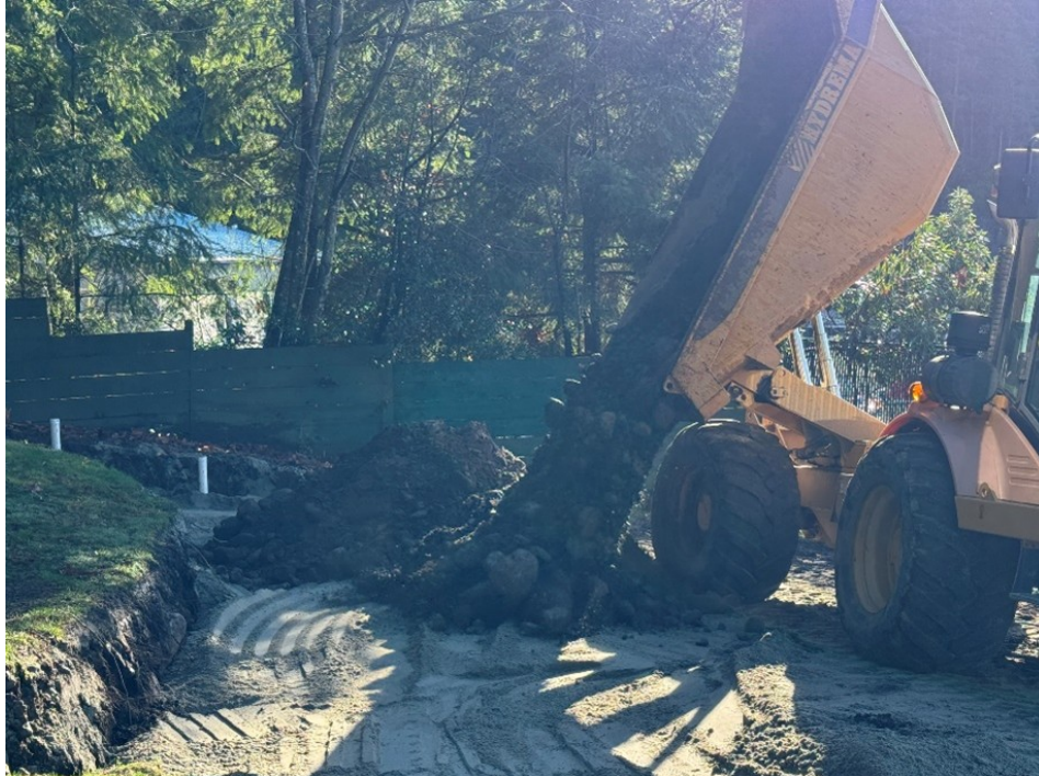
Septic Field Expansion