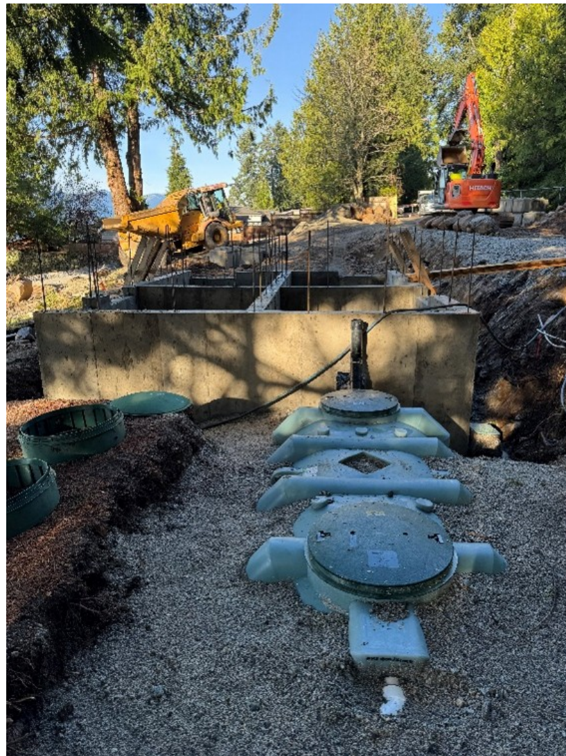
New Septic Tank Installation