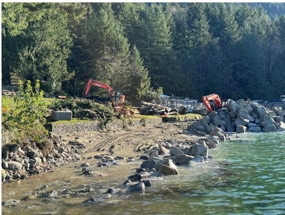
Preparation Works for Jetty Replacement