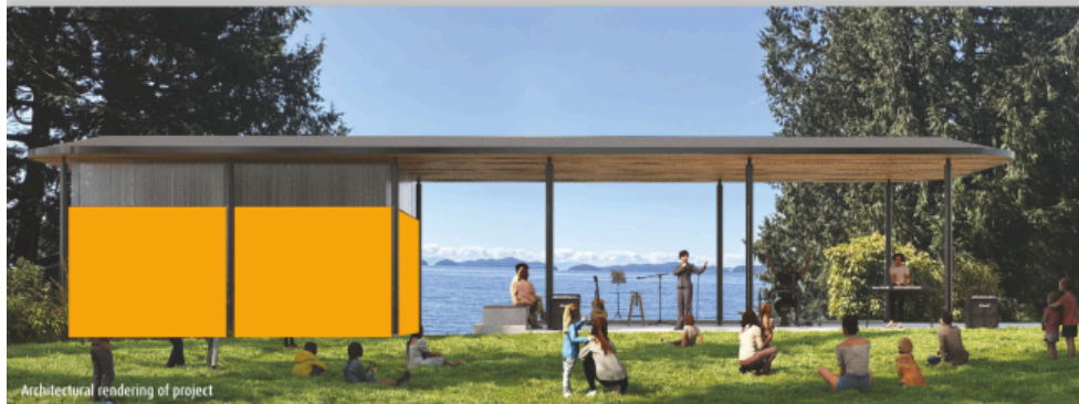
Architectural rendering of project